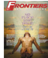
Vol. 22, Iss. 17